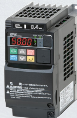
AC Motor Driver