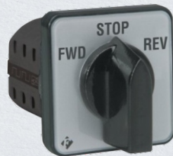
Right-Left Direction Switch