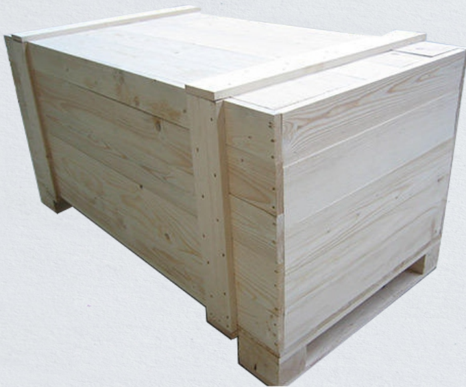
Wooden Crate for Overseas