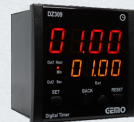
The mixture Time Digital Time Clock